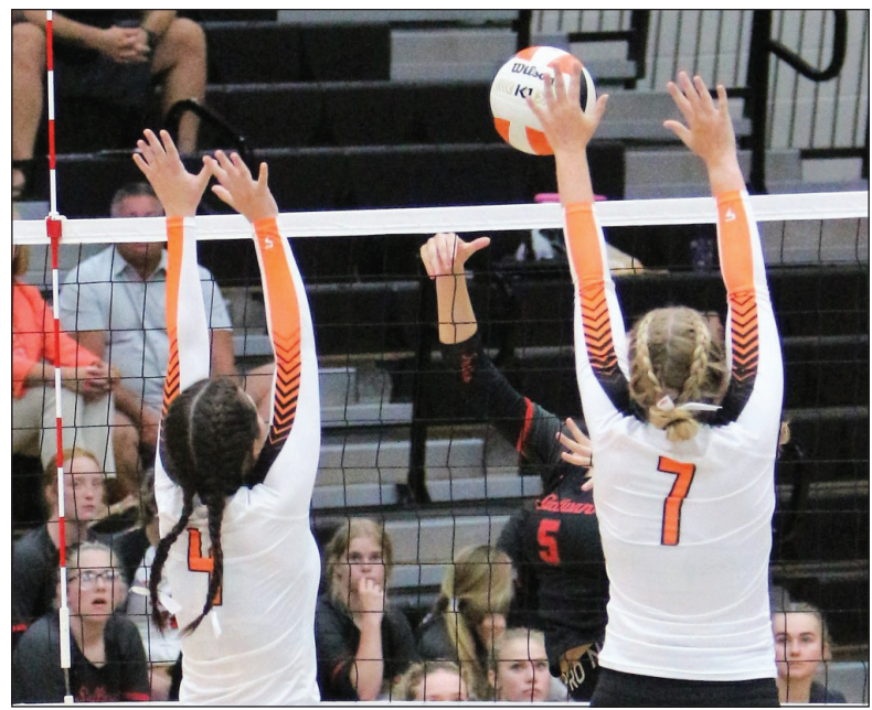
A pair of Tiger blockers fully extend during a PHS Volleyball match.

Sept. 26 at Oblong High School 6:15 p.m. Sept. 30 at Riverton Parke Jr/Sr HS 5:45 p.m. Oct. 2 at Salt Fork High School 6:00 p.m. Oct. 3 at Marshall High School 6:00 p.m. Oct. 7 at Chrisman High School 6:00 p.m. Oct. 8 Richland County High School 6:00 p.m. Oct. 10 at Mt. Carmel High School 6:00 p.m. Oct. 12 Paris Tiger Classic 8:30 a.m. Oct. 14 Terre Haute North Vigo HS 5:00 p.m. Oct. 15 at Tuscola High School 6:00 p.m. Oct. 17 Robinson High School 6:00 p.m. Oct. 21 Neoga High School 6:15 p.m. Oct. 24 at Newton High School 6:00 p.m.