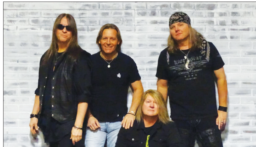
Special to The Prairie Press

■ The era of big hair and rock and roll will make its triumphant return on Friday, July 26. Big Guns, an 80s rock and roll cover band, will perform in the Edgar County Fair party barn. Admission is free.