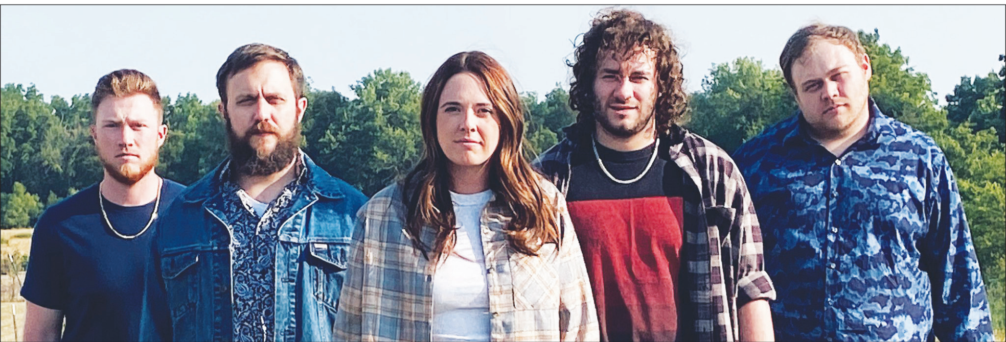
Special to The Prairie Press

Whiskey Sour, a band loaded with local talent, will close out the Edgar County Fair on the party barn stage on Saturday, July 27. Admission to the show is free.