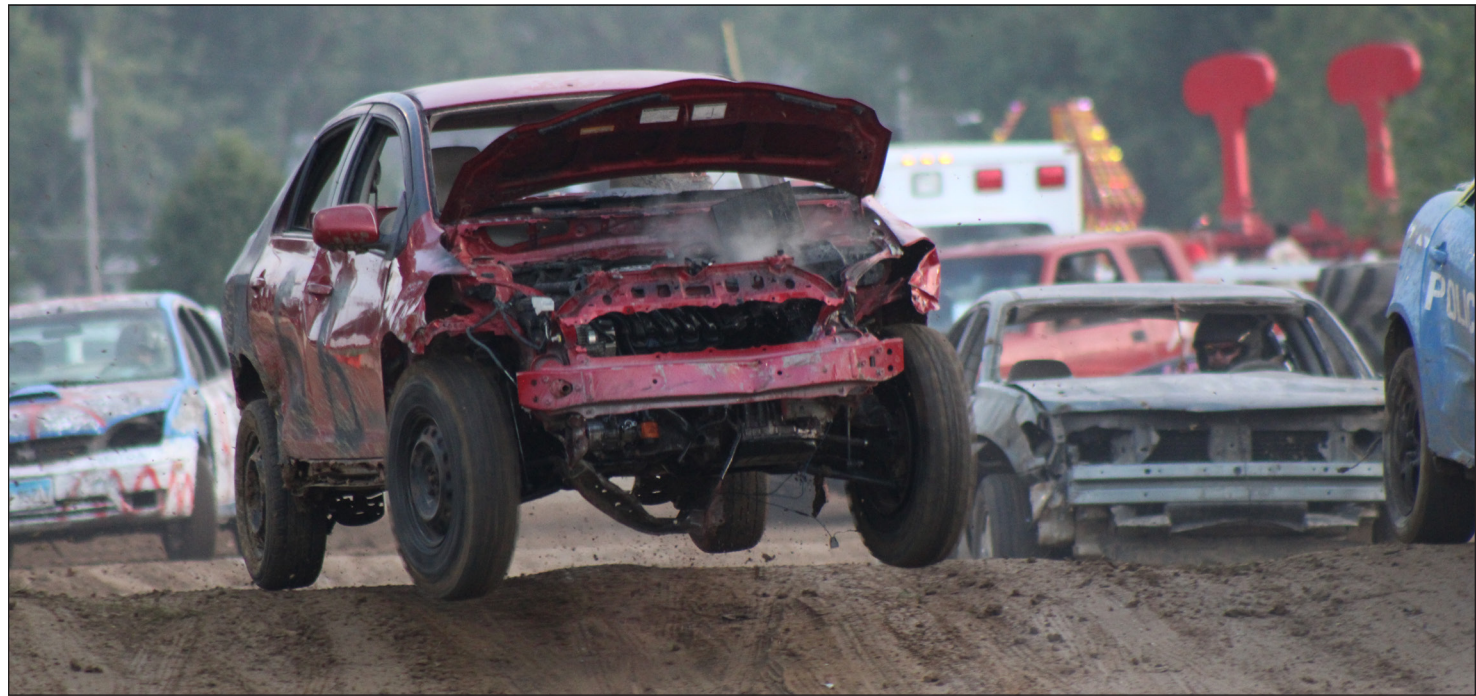
Some drivers went all out for 2023's Edgar County Fair Junkyard Autocross. This driver did not let his hood flying up stop him.

With exciting and changing times, the girls competing in this adrenaline rush of a race will have a fun and friendly competition that will have the crowded grandstands on their feet.