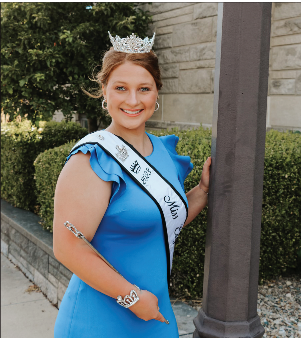
Special to The Prairie Press

Information about the Edgar County Fair Queen Pageant or other fair week events can be found online at www.edgar-countyfair.com